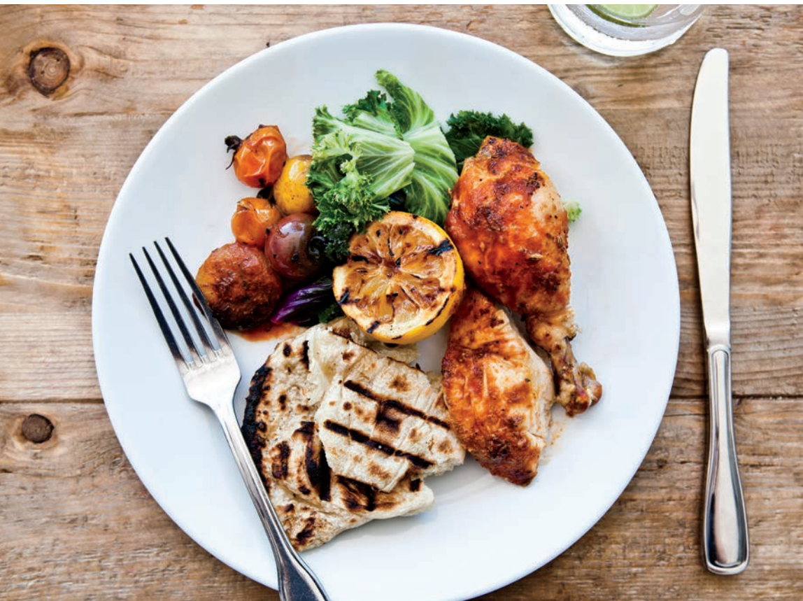
Icebox Cafe's organic chicken with a sherry vinegar reduction, roasted tomatoes, and pearl onions, served with a side of Swiss chard and grilled lavash bread.